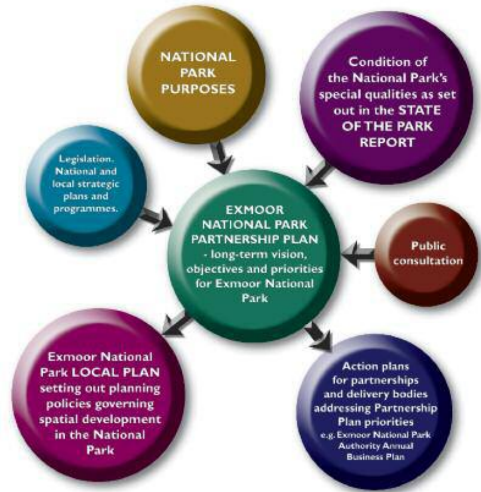
How the Plan links to other plans and strategies (Figure 2)