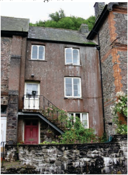
19th century villa (at Lynbridge) with vertical emphasis stepped into hillside.

Close cluster of simple, small scale, roadside cottages, with small, steep, and "wild" gardens.