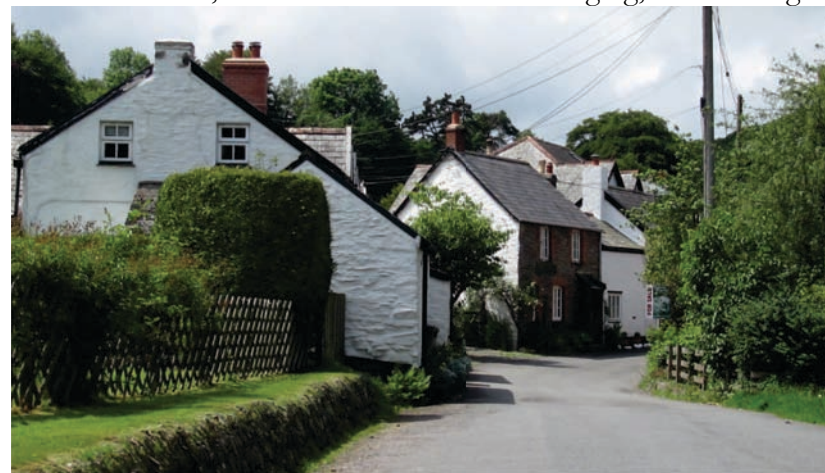
Small-scale roadside cottages, showing a good balance between unity and variety.