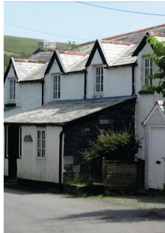
Small-scale units, with slate roofs and slate hanging, abut the highway.