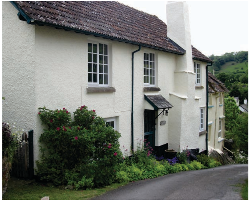
Roadside cottages accommodate steeply sloping sites and abut the highway.