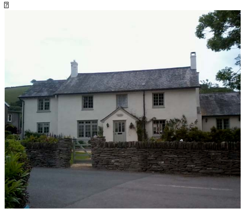
Slate roof, with rendered walls, varying roof heights, sitting parallel to the highway with a bold boundary.

Examples of the Characteristics that Reinforce Character and Local Identity and Provide Models that could be Referenced in Future Development.