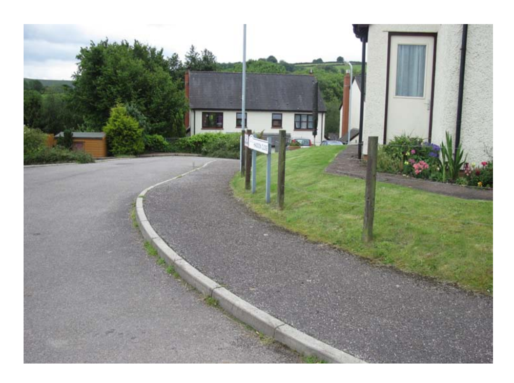
Suburban highway treatment found in recent development weakens character.

Examples of the Characteristics that Weaken Character and Local Identity and Provide Models that could be Referenced in Future Development.