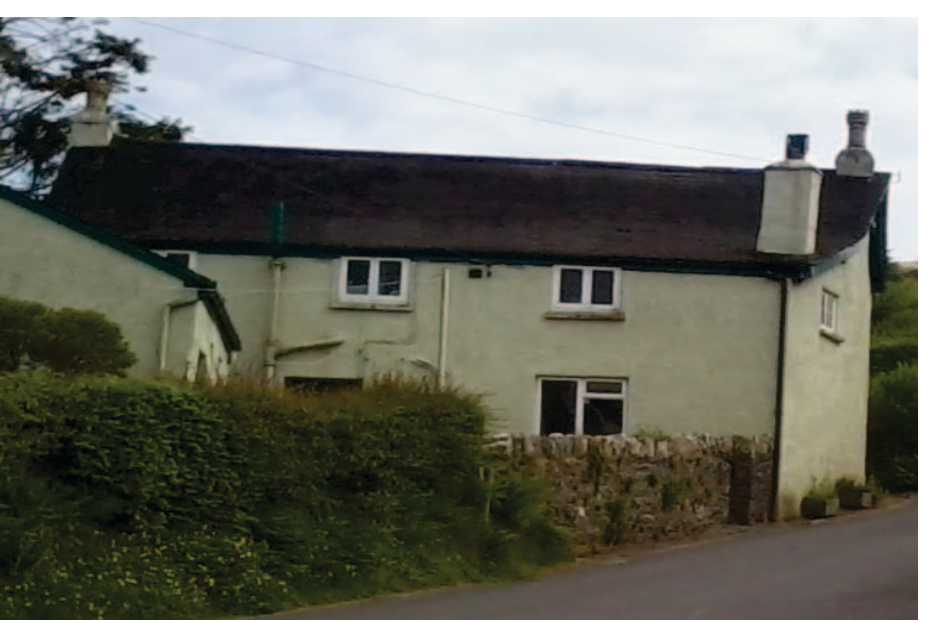
Vernacular small-scale cottage, rendered, with slate roof, abutting the highway with strong boundary and sitting in the landscape.

Examples of the Characteristics that Influence Character and Local Identity and Provide Models that could be referenced in Future Development.