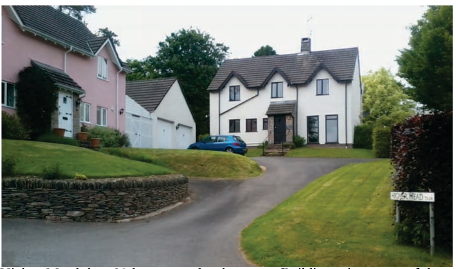
Higher Mead, late 20th century development. Buildings sit on top of the site, rather than within it, have weak boundaries and a suburban curtilage - elements that weaken the settlement's character. Low level screening from the highway would help.