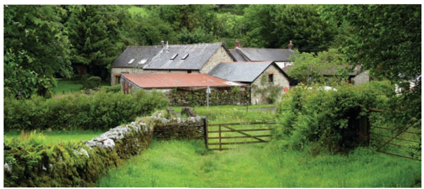
Buildings set in an extensively farmed landscape with gardens of grass, wildflowers, stone walls, ferns and hedgebanks.