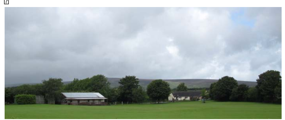
Long, low buildings relate well to horizontal landscape character of plateau. Dark materials appear unobtrusive.