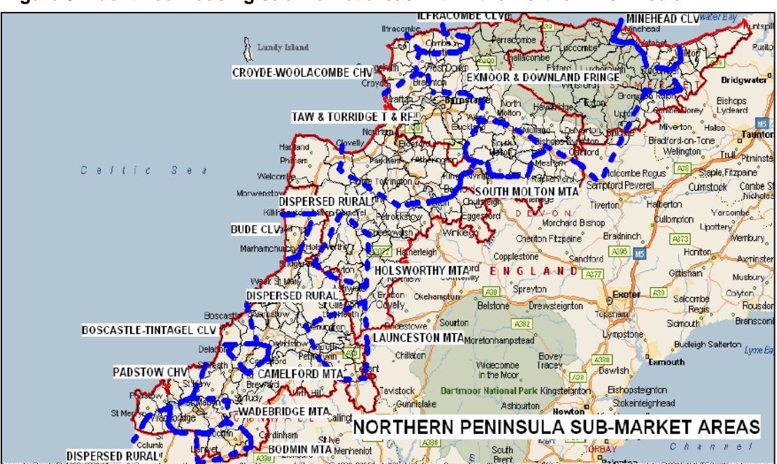
Figure 3 - Identified Housing sub-market areas within the Northern Peninsula HMA