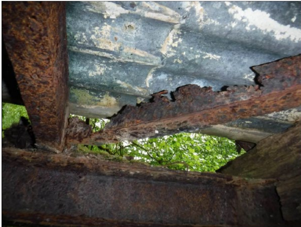
Photograph 17. -View of the Typical Section Loss to the diagonal Bracings

The bridge was inspected by an engineer in May 2025 and was closed immediately on receipt of the report which found it to be an overall 'critical condition'. Understandably members of the public have voiced their frustration and disappointment at the closure of the bridge on this popular route. We have kept it open as long as we possibly can but now have no choice but to close it and direct all available resources to working with the relevant landowners towards getting it replaced as soon as possible. Public safety has been at the centre of all decisions relating to the bridge – and very much still is.