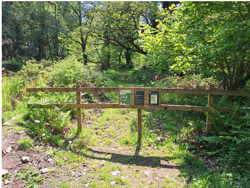
National Trust Barrier and Explanatory Signage in Eastwater Valley on Closed Permitted Path