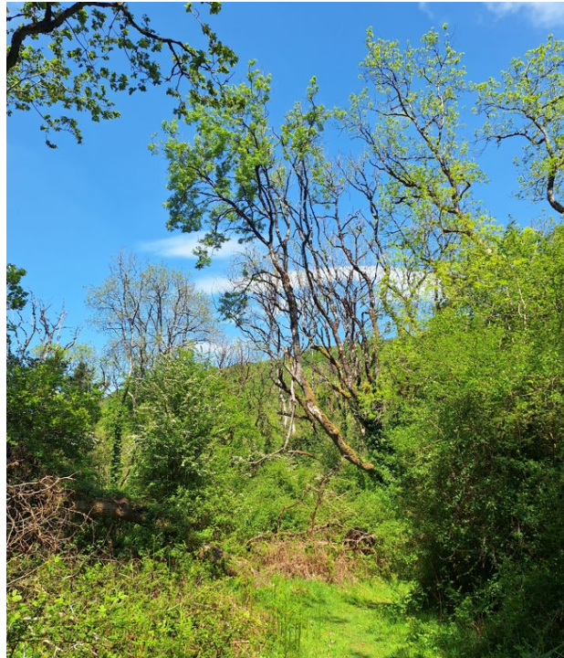
Signs of Severe Ash Die Back in Trees surrounding the Closed Permitted Footpath