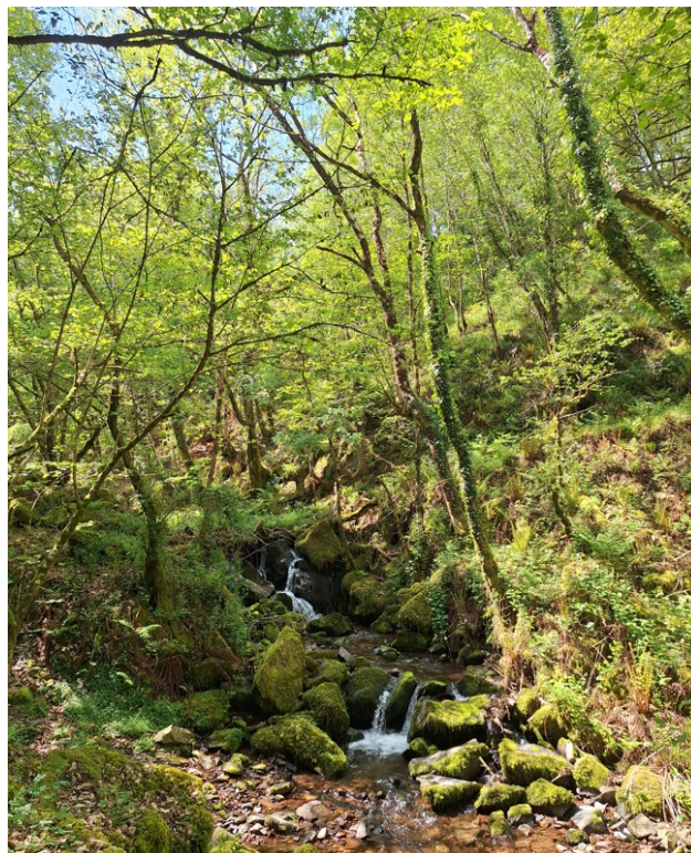
Higher Reaches of the Eastwater Valley – Open Access Land but the Permitted Path is no longer maintained by the National Trust