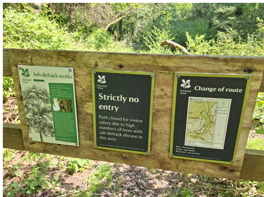
Close up of Signage