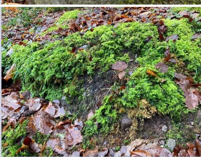
Gravel under my feet