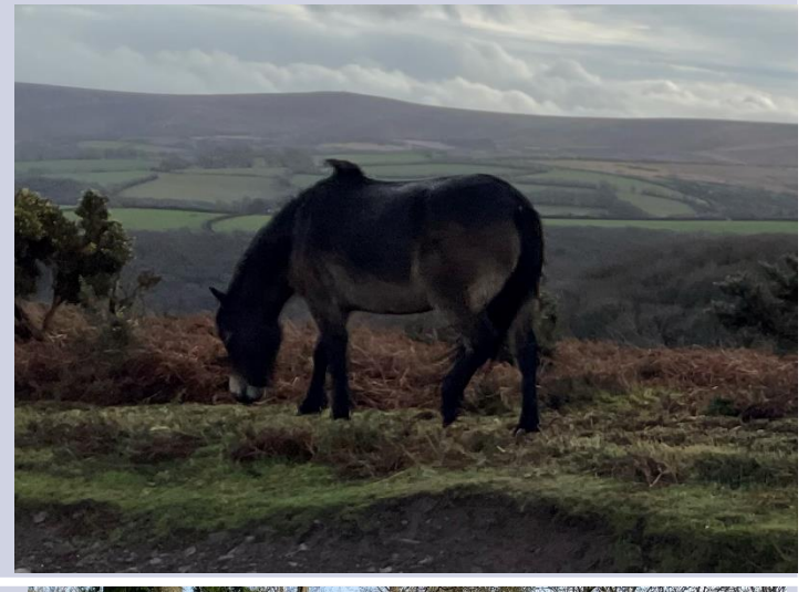
Bracken, which have lots of pointed leaves

Ponies. They are special ponies called Exmoor Ponies