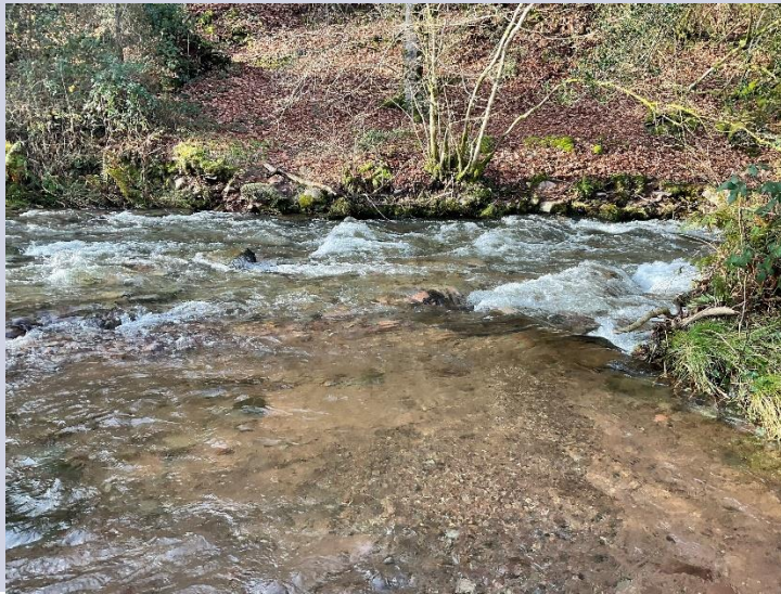
The wind blowing through the trees