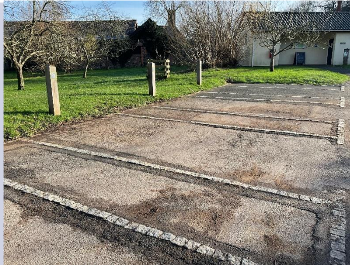
An information board