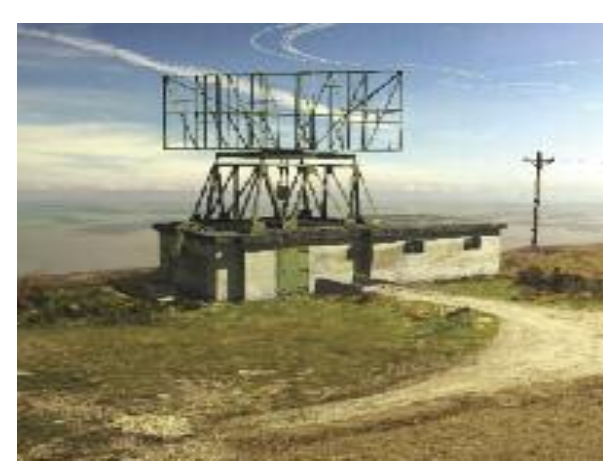
North Hill Radar Station Reconstruction illustration by Peter Lorimer

Although it was recognised as being an important issue no group identified progress in this area. Is the sample of dated monuments large enough? A suggestion was made that more work should be done to consider Exmoor in its wider regional and national context generally and this should be covered by priority 1.