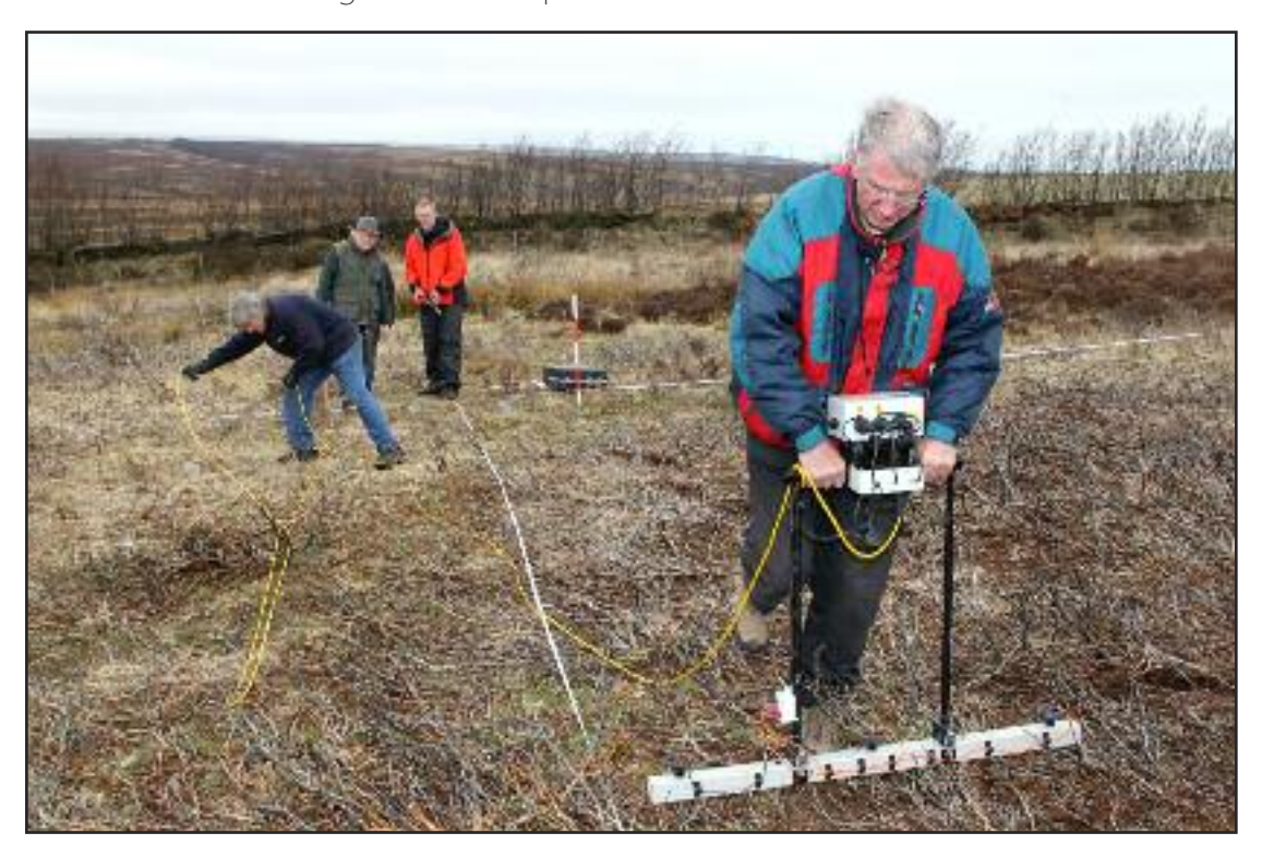
Carrying out a geophysical survey of Porlock stone row as part of Dig Porlock 2013

Although much work has been undertaken there is still much to be done to further this objective. Significant advances include widening the range of site types recognised with the identification of sites previously undocumented such as 2 burnt mounds at Hoccombe Combe and Spooners and the possible mortuary enclosure on Challacombe Common. Dating and chronology remain problematic and levels of archaeological excavation able to answer specific questions are low. Further synthesis of existing research and material and a focus on specific aims or techniques to explore questions is required. Greater use of geophysical survey and interrogation of LiDAR is recommended. Some work has indicated landscapes buried by peat development and this needs more analysis. More targeted work to relate the onset of peat accumulation to known archaeological sites is needed. Peat accumulation starts at different times in different locations according to slope, aspect, drainage vegetation management etc. The palaeo-environment research needs to be designed to investigate past grazing and other management regimes e.g. swaling. Could the relative past grazing levels be compared for example in the Bronze Age and Medieval periods? This could link to other interests such as faming and landscape studies.