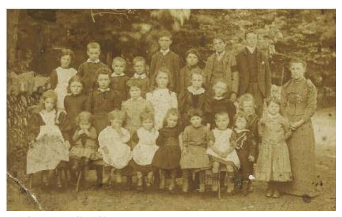
Simonsbath schoolchildren 1880s

15. Social History A priority for future research is the development of tourism on and around Exmoor. This should be seen also in the context of leisure and sporting activities such as horse riding, hunting and fishing