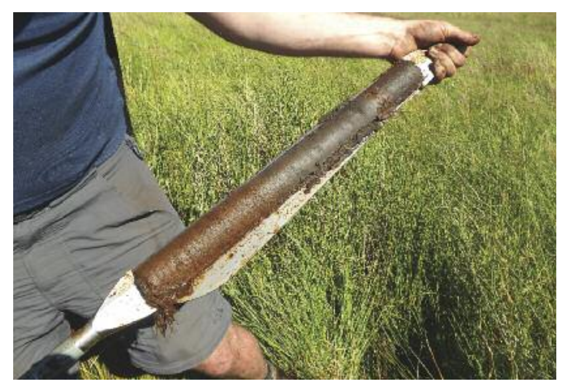
Sampling a peat sequence on Ricksy Ball, July 2012.