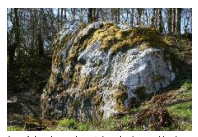
One of the white rocks in Ashcombe designed landscape

Consider further research into 'at risk' landscapes e.g. Ashley Combe. The Simonsbath work is beginning to understand the Knight endeavours better but more work needed, some specific questions