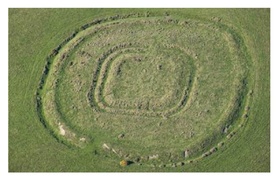
Old Burrow Roman Fortlet Historic England 2012 27468_027

7. The Roman Landscape To further our understanding of the Roman landscape of Exmoor by carrying out research into the nature of military occupation on and around Exmoor, by investigating native settlement and by extending the research begun by the Exmoor Iron project into the iron industry during this period. A fundamental part of achieving this objective is the publication of the existing research carried out by the Exmoor Iron Project. SWARF research aim 50 (p291)