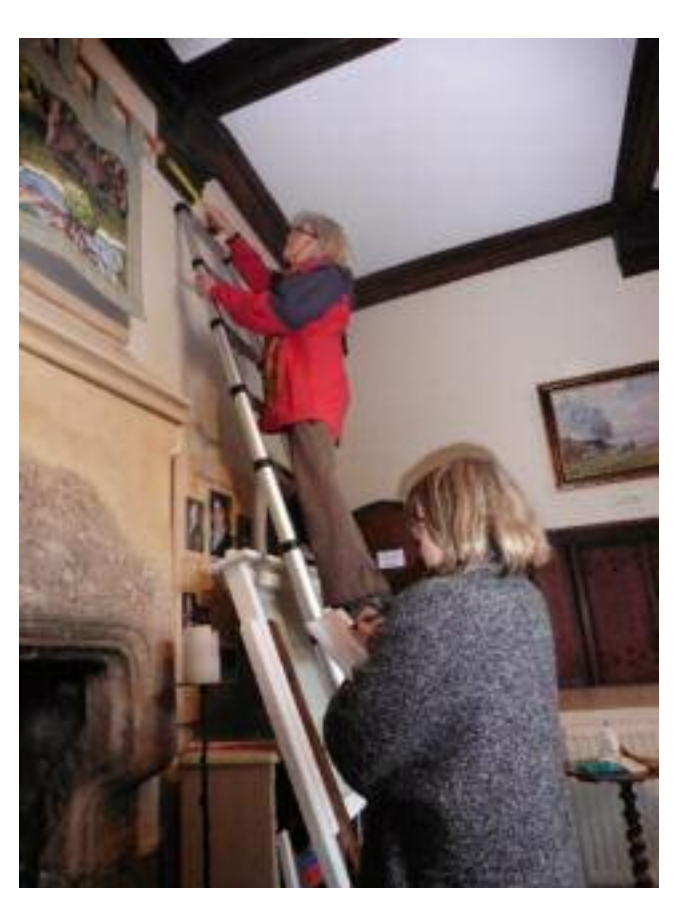
Exmoor and West Somerset Buildings Research Group recording in Porlock

There is increased vernacular building recording being undertaken although much to be done. The continued resourcing and support of the voluntary sector