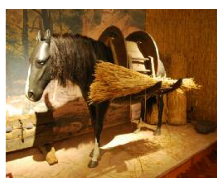
An exceptional set of packhorse equipment from an Exmoor farm has been preserved at Torquay Museum

Opportunities for working with local museums and volunteers with appropriate support. Recent studies (e.g. routeways and turf cutting) have shown the potential for Exmoor collections to be held in regional and national museums and more may be held in private collections.