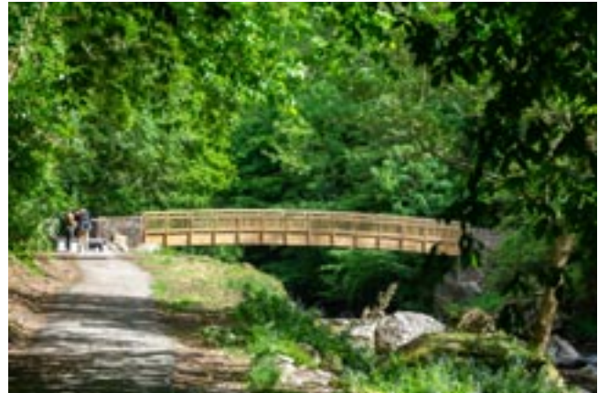
Woodside Bridge completed

Exmoor National Park Authority and Lyn Community Development Trust campaigned to raise funds for a new footbridge at Woodside on the East Lyn Valley near Lynmouth with a formal CareMoor appeal launched in 2018.