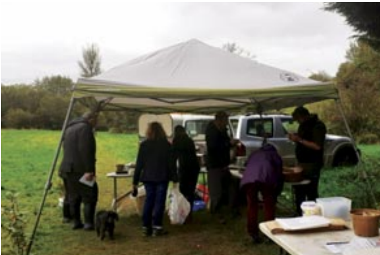
Tree Nursery open event, October 2021