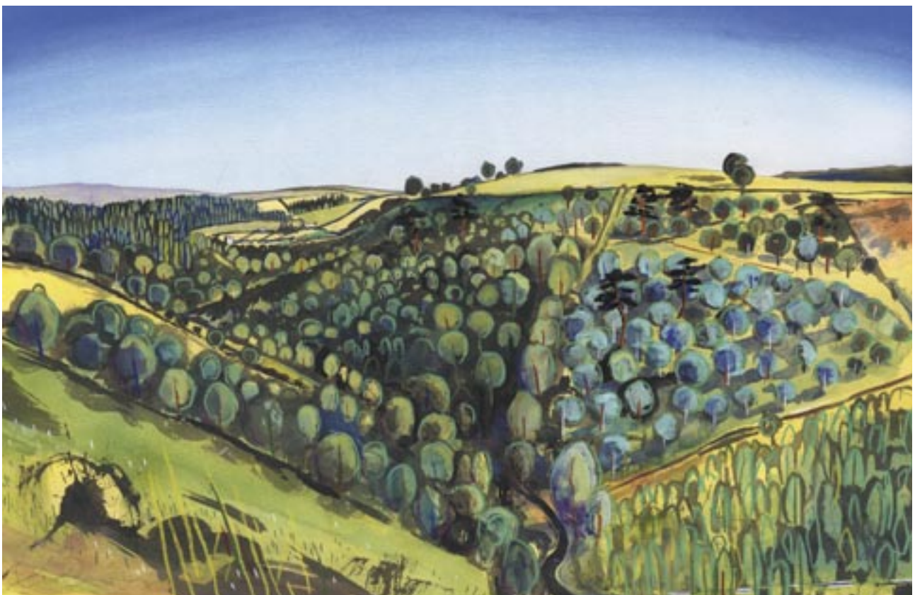
Artist's impression of Bye Wood by Leo Davey

With help from CareMoor donations we can scale up our efforts to plant 13,000 trees, using only the best environmentally-friendly practices and materials to create a unique and sustainable woodland that will be treasured for years to come.