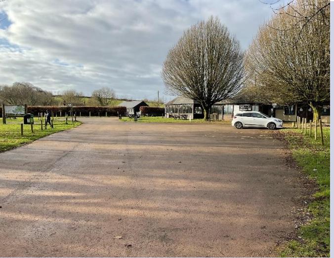
The machine where people buy a ticket to park their car