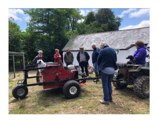
Brush harvester demonstrations at the National Meadows Day event.