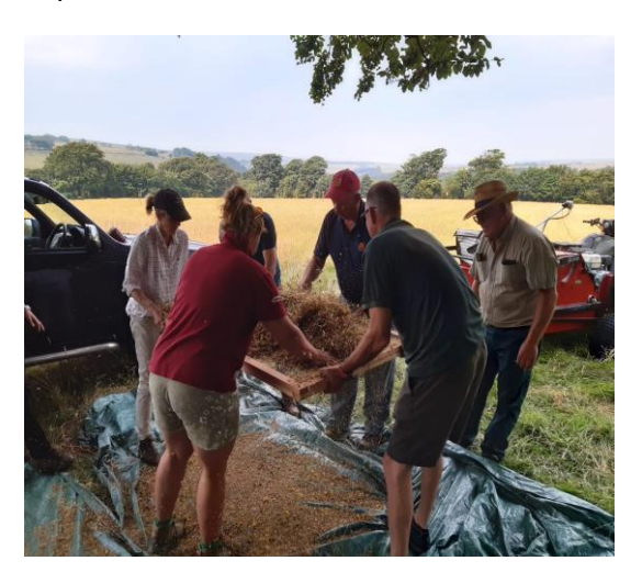
Seed sieving in the 2022 harvest.

Black knapweed and field scabious seed was gathered by FWAG SW and another trained local contractor, from 0.4 ha of a species-rich meadow near Exford. Some of the seed was distributed to the 2022 recipients and some has been retained to be propagated.