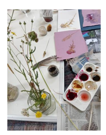
The botanical drawing class, using natural pigments, collected locally.

These have comprised wellbeing events such as botanical drawing and writing, plus technical skills courses including scything and botanical monitoring.