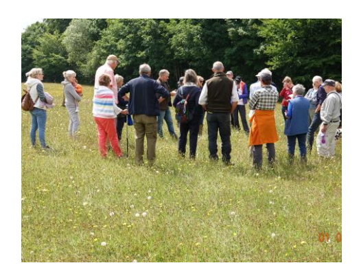
Talk at the National Meadows Day at Exmoor

The project has now secured funding until March 2025, so we will continue to work with communities across Exmoor to create and restore species-rich grasslands, and look to inspire an appreciation of our valuable meadow habitats.