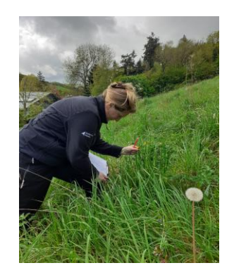
Project officer carrying out a botanical survey

The project team is undertaking detailed botanical surveys of grasslands, surveying the meadows previously seeded to report