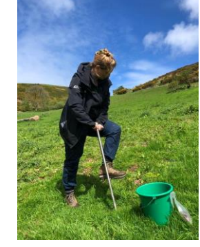
Project officer carrying out soil sampling

We have been carrying out soil testing to determine the suitability for wildflower establishment. Soil and botanical survey results inform management decisions contribute to the grasslands inventory.