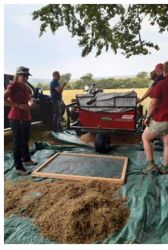
Brush harvester collection at the donor meadow in 2022

44 landowners and managers engaged with the project comprising 24 farm businesses, 15 small holdings and 5 community groups.