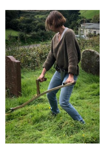
One of our meadow owners learning to scythe on our scything course taught by Somerset Scythe School.

The project has been working with a local school to develop a meadow area, working with pupils to sow meadow seeds in autumn then to plant the germinated seeds, creating a meadow area in the playground.