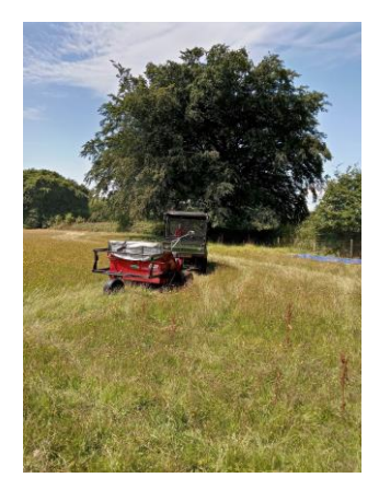
Harvesting wildflower seed

We are continuing to collaborate with our partner organisations such as DWT and FWAG SW, and working with the National Trust, The Exmoor Society, and other organisations, on meadow restoration projects.