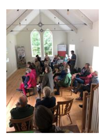
Talk at the National Meadows Day event in collaboration with The Exmoor Society and FWAG SW.