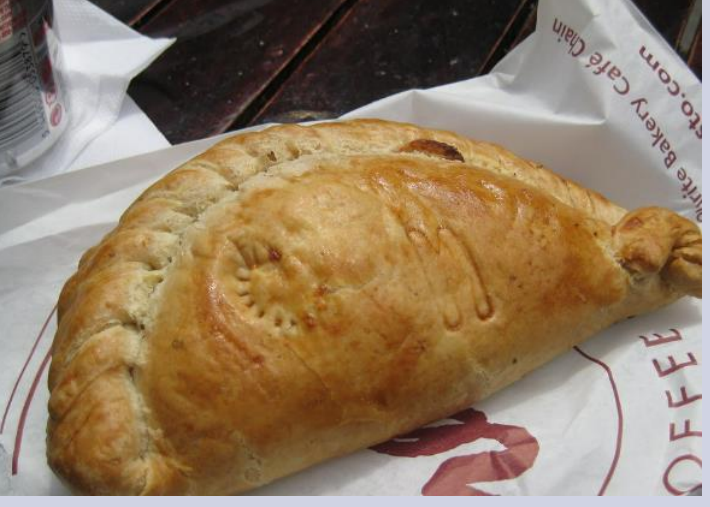
My picnic if we have brought one.