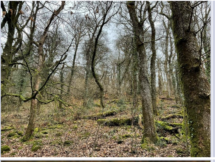
Bluebells during the Spring