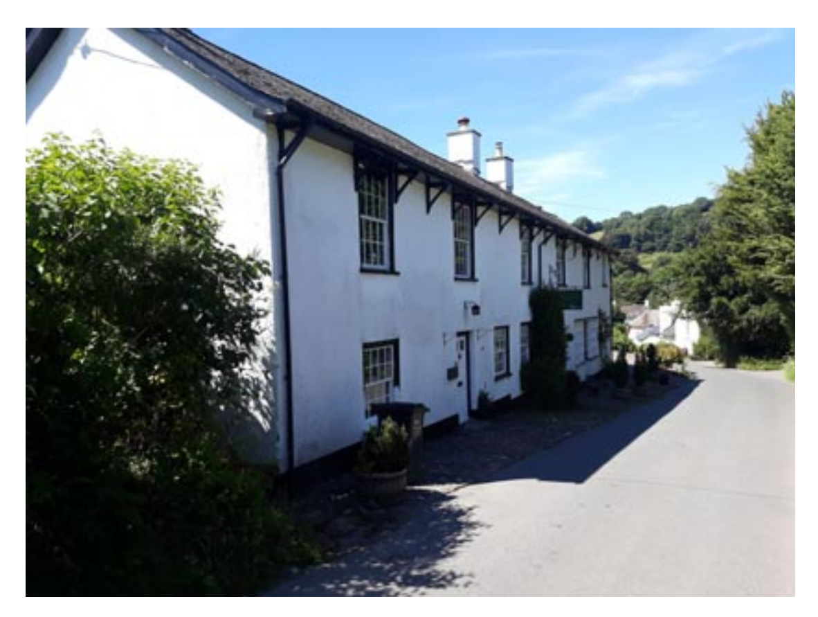
Fig.15 Karslake House has 16th century origins, but most frontage detail is 19th and 20th century, including a former shop-front added in the early 20th century.

Of the most prominent secular buildings, The Royal Oak Inn , has pride of place in the village. Thatched and rendered, it was formerly a farmhouse before becoming an inn, and with annexes to the side and rear is now also a hotel. The original building, probably three-cell and cross-passage, dates from the 16th-17th century, with a cross-wing extension at the second bay to the left. It has been much altered and enlarged since the 19th century and most of the distinctive fenestration, including timber casement windows, some with astragal glazing bars, is 19th-20th century. The projecting cross-wing, dormer window set in adjoining catslide extension, prominent swept eaves and gabled porch, all thatched, contribute to a frontage of exceptionally picturesque character. Pevsner describes the building as having thatch undulating over dormers and of being mostly late Georgian too with an older core