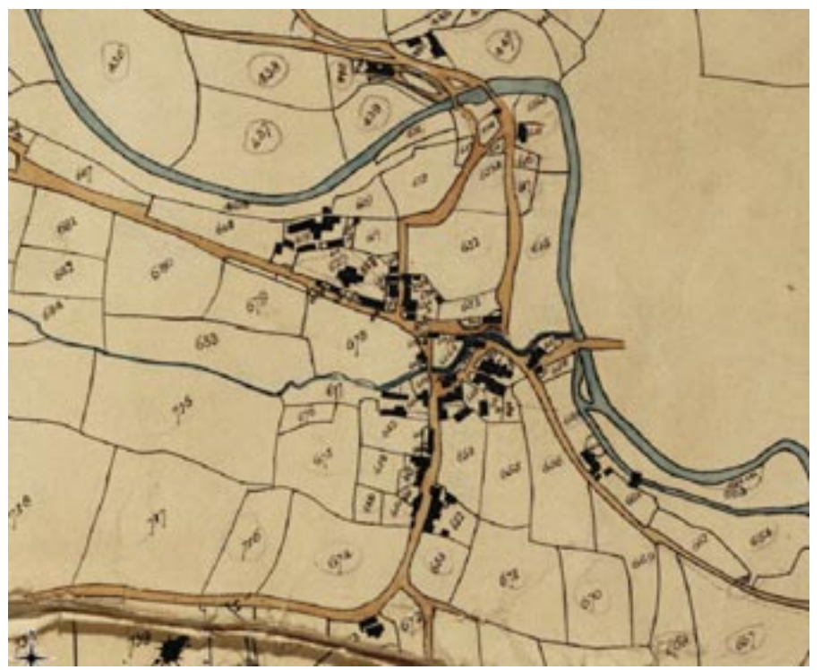
Fig.1 Extract of Tithe Apportionment Map of c.1839.

Post war development has generally occurred along radial routes that converge on the village centre with some infill. The most significant recent development was the construction of six affordable home at Darby's Knap in the 1990s, on the edge of the village adjacent to Edbrooke Road. Two further local affordable homes have been provided along Ash Lane.