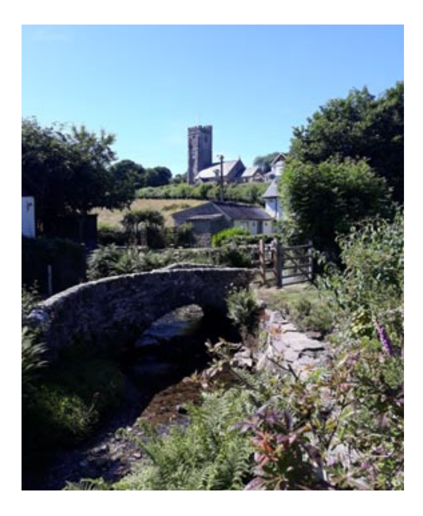
Fig.12 View from the green to the Church