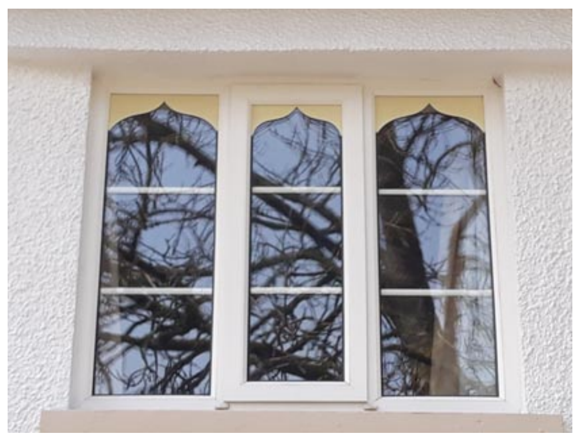
Fig. 46 Plastic windows fitted to the tea-rooms

Most historic buildings, both listed and unlisted, are generally well maintained. Some former farm outbuildings both within or on the borders of the village, although inherently structurally sound, appear to be suffering some neglect or under-use. A large proportion of timber windows and entrance doors survive in their original form, or where replacements have been made, these have tended to closely match the traditional form and still predominate. Even so, PVCu replacement windows and doors are starting to make inroads into the village and are most evident when installed within the close-knit pattern of early development. Such replacements, even where they closely match the traditional glazing and joinery patterns, inevitably introduce an artificial product that in a historic setting can all too easily destroy the visual integrity of even the most modest of traditional buildings.