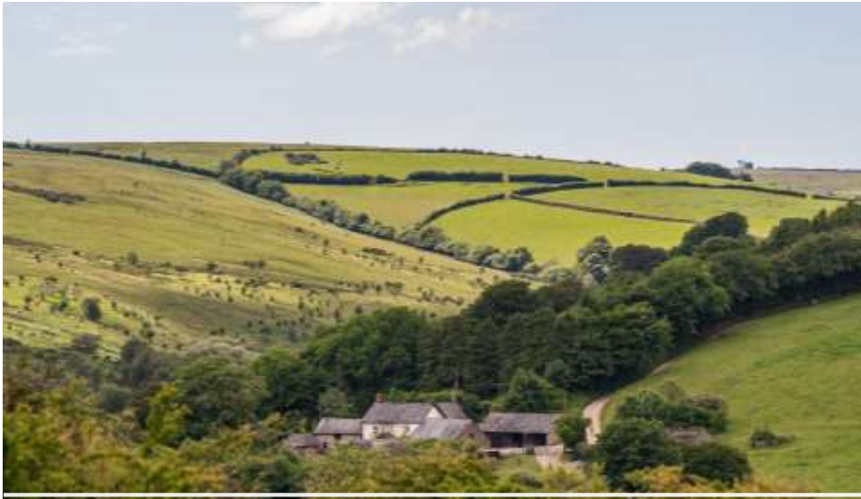
Future of Farming of Exmoor