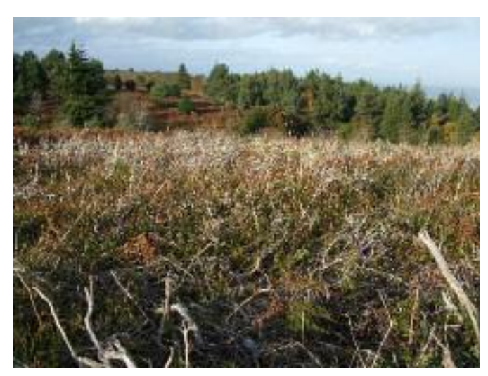
Managed heath, Gallox Hill