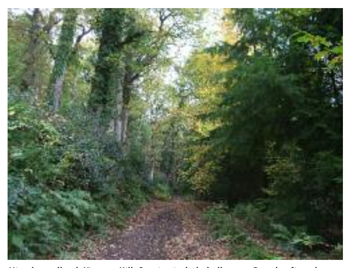
Mixed woodland, Vinegar Hill. Species include holly, yew, Douglas fir, oak, ash, beech and sweet chestnut \,