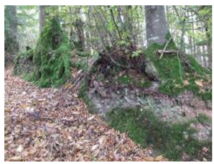
Former field wall within plantation