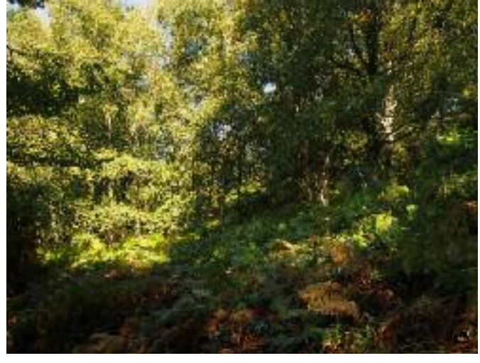
Encroachment of bracken and silver birch onto formerly open heath at Alcombe Common