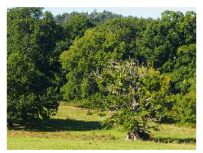
Veteran oak trees, Dunster Park

Some areas of lowland heath survive (for example at Black Hill) and there have been ongoing programmes of heathland restoration. Heather can often be seen alongside the verges of the few roads that cut through the trees, as well as at plantation edges. However, although there are areas of heath, there is also a sense of a battle to compete with the plantations, with added threats of encroachment from bracken, gorse and self-seeding deciduous trees. Without adequate grazing, heath is managed by cutting which creates an unnatural appearance. Much of the LCT is covered by the Dunster Park and Heathland Site of Special Scientific Interest, designated for its lowland dry heath (supporting the nationally-rare heath fritillary butterfly), dry lowland acid grassland, wood pasture with veteran trees (supporting a nationally-significant assemblage of beetles) and ancient semi-natural oak woodland habitats which support many species of ferns, mosses, insects, birds and mammals, including deer.