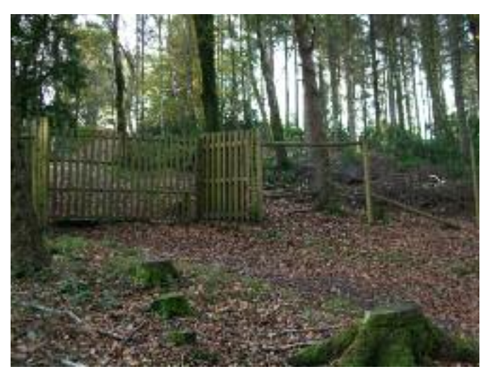
New deer-proof fencing and gates on Black Ball, part of Dunster Forest