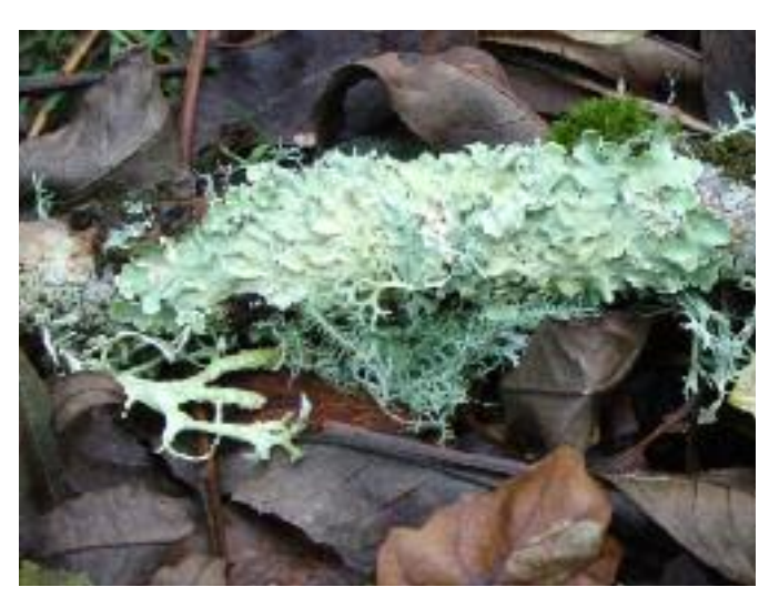
Detail of lichen-covered twig, Dunster Park woods