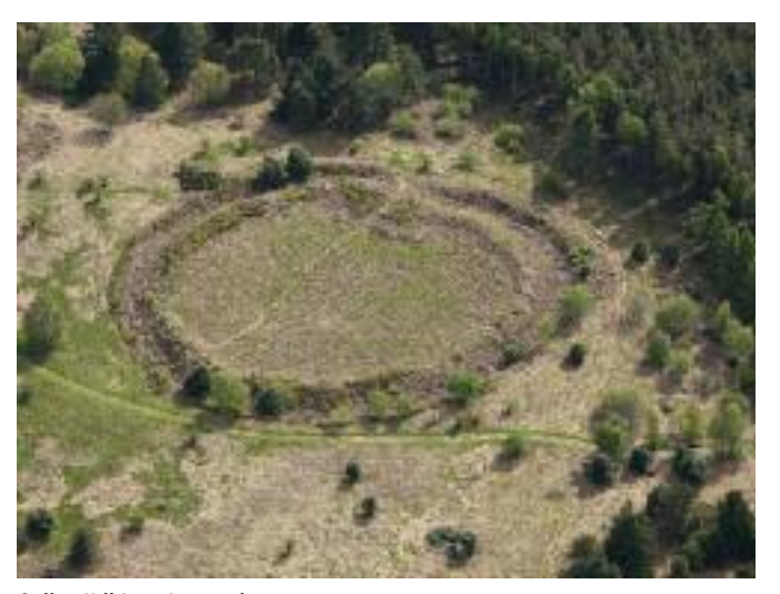
Gallox Hill Iron Age enclosure