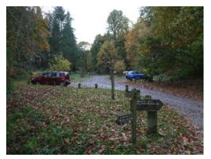
Nutcombe Bottom car park. Popular trails give the landscape a more recreational character.