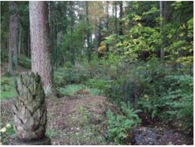
Entrance to the Dunster Forest Tall Trees Trail